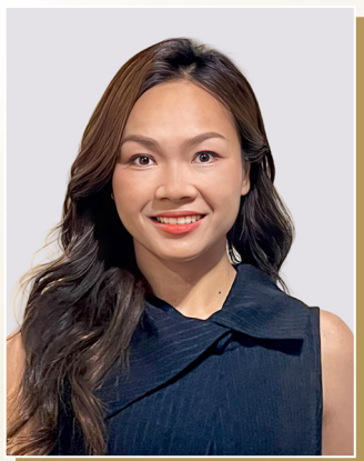
Dr Sarah Lee Wai-sze, DSocSc, SBS, MH Creative and Professional Writing

Dr Sarah Lee Wai-sze stands as one of the iconic sports figures in Hong Kong. Known by the household name “Cycling Goddess of Lower Ngau Tau Kok Estate”, she is a two-time Olympic bronze medallist. Dr Lee consistently demonstrates both unparalleled resilience on the track and remarkable academic endeavours off it. While dedicating her career to track cycling, she achieved notable academic results, earning a Bachelor’s Degree in Health Education from The Education University of Hong Kong (EdUHK) in 2017 and a second Bachelor’s Degree in Creative and Professional Writing from HKBU in 2023, the year she retired from the sport. Her continued pursuit of knowledge exemplifies her strong commitment to lifelong learning.